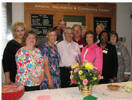
Volunteers take part in the 2008 Alumni Graduation Tea

Thank you for acknowledging the foundation of your education and for giving back to your College by joining the HJC/HCC Alumni Association today! We value your support!