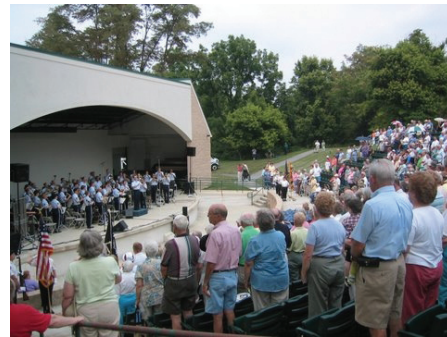
Crowds Enjoy the Alumni “Red, White & Blue” Concert Series at the Alumni Amphitheater at HCC