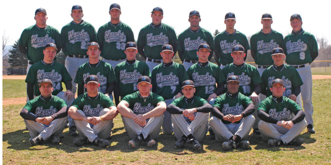
The Hawks Baseball Team finished third overall in the NJCAA World Series in Grand Junction, CO