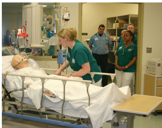
HCC nursing students treat a manikin patient in the new nursing lab

In 1968, the College began a two year registered nursing program that worked in cooperation with Washington County Hospital to transition the hospital's diploma program in nursing to HCC. The first class graduated 19 students. Five years ago, we added a practical nurse program, which can be completed in one year. Students in the registered nurse program can earn their degree in two years and one summer once they have completed prerequisite coursework.