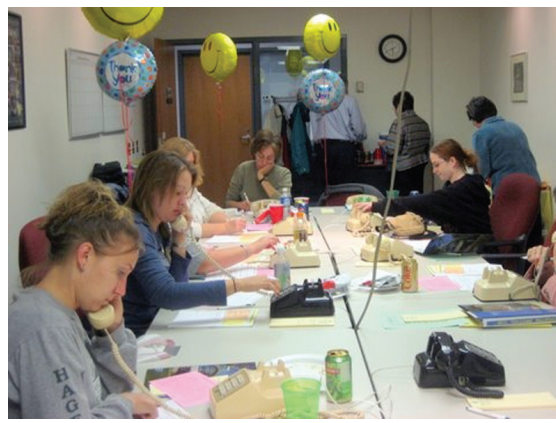
Volunteers make calls to HCC/HCC graduates during the College’s Annual Fund Phonathon

Calls were placed to graduates from the classes of 1948 through 1997. Over 3,998 calls were made to alumni telling them about happenings at the College, updating their College records, and inviting them to give to the Annual Fund. Our phonathon not only helped raise needed dollars for the College, but also allowed us to revise our database and find incorrect phone number and address information and bring them up to date. So, we want to thank each of you who donated and who took the time to speak with us during our event.