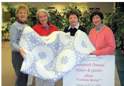
Quilt Winner Receives Prize at the 14th Annual Flower & Garden Show