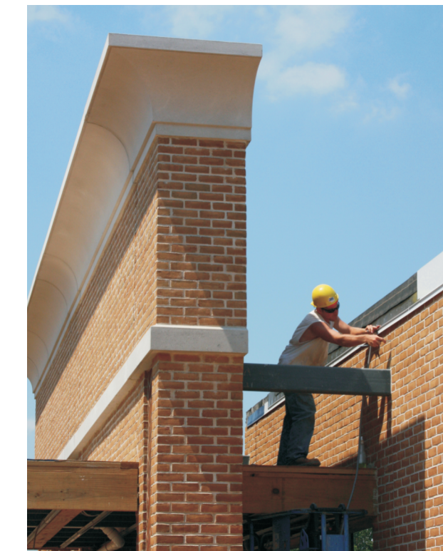
A construction worker puts the finishing touches on the exterior of the Career Programs Building.

Funding for the project has come from mixed sources. Approximately 39 percent of construction costs has come from the county and 61 percent from the state. Furniture and equipment expenses have been covered primarily by donations to HCC's Foundation and through the Waltersdorf-Henson Challenge.