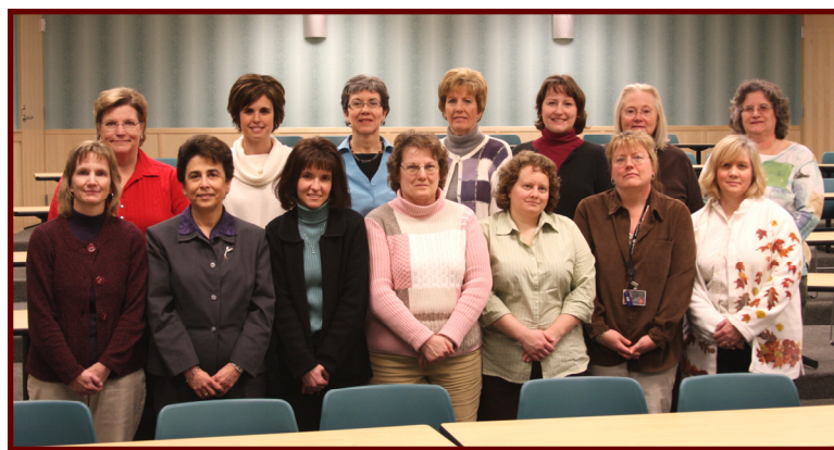
Above Right: The new Nursing Division

The new Health Sciences Division will oversee the credit programs of radiography, medical assisting and phlebotomy, dental assisting, which is in the early developmental stages, and paramedic emergency services. In addition, this division will also oversee non-credit nursing and allied health science courses.