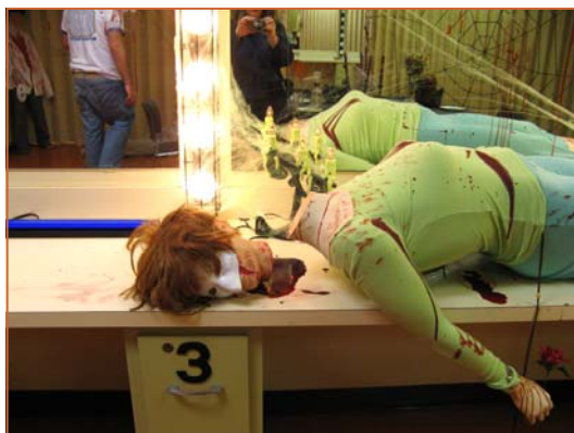
Middle and bottom: Still images from the Haunted Theater.