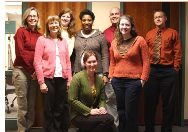
Above Left: "A three-hour tour..." Academic Advising takes on Gilligan's Island