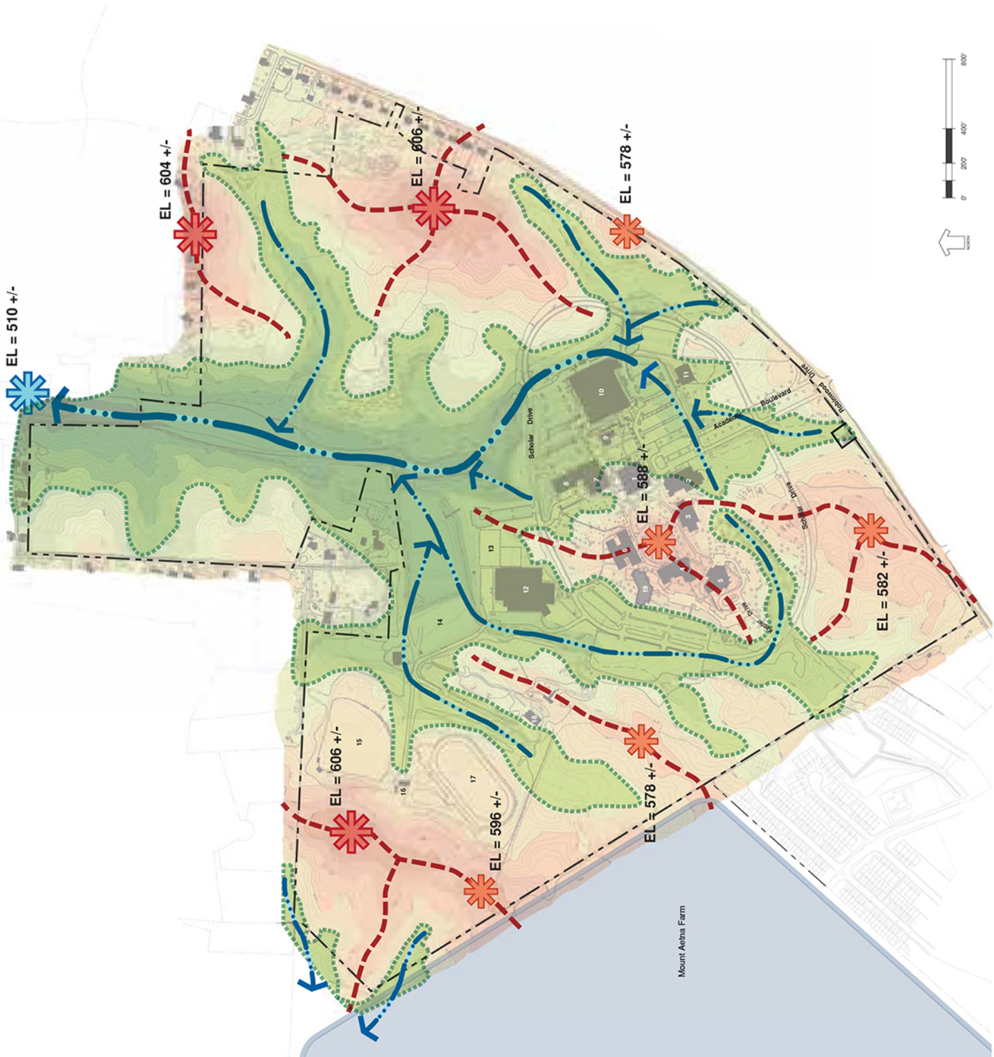
Exhibit 6: Landform Study