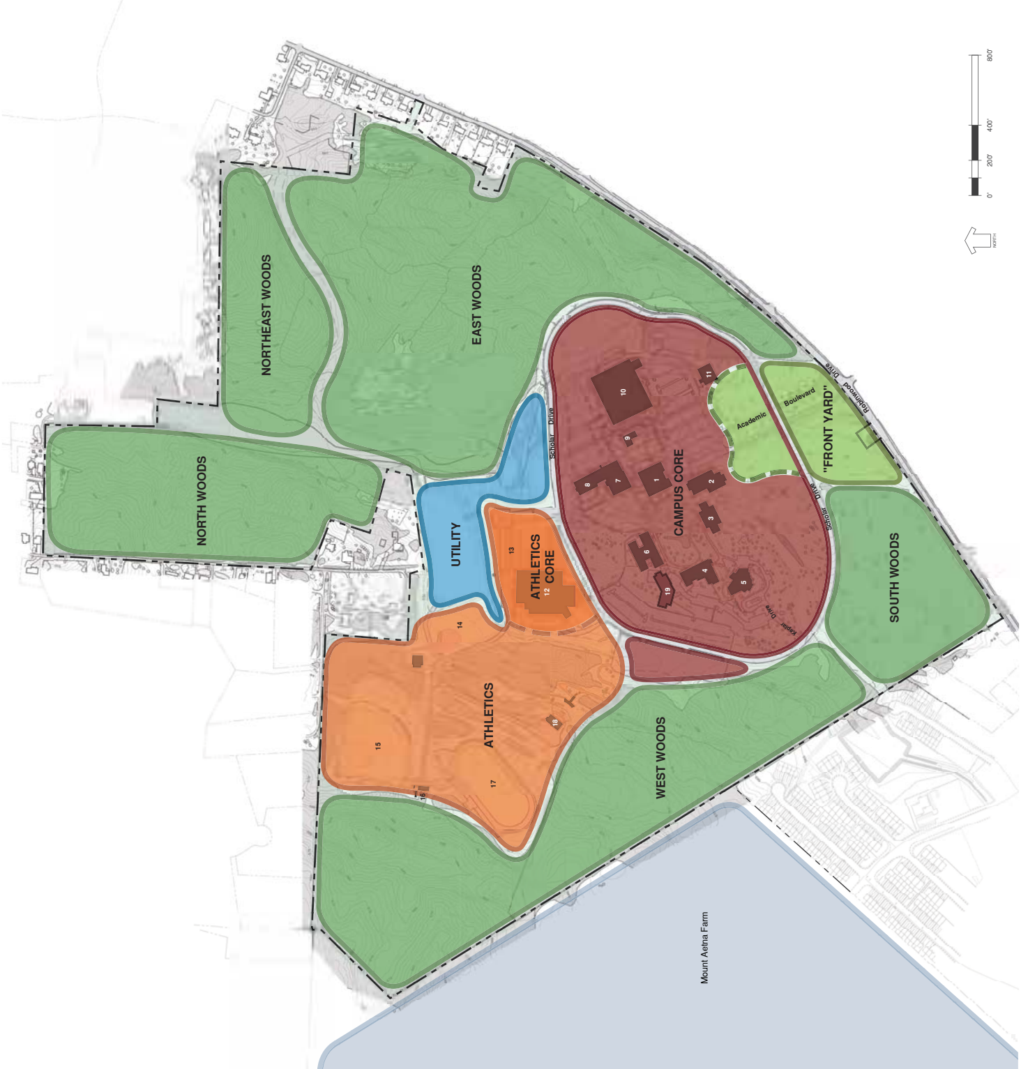
Exhibit 7: Campus Districts

Hagerstown Community College CAMPUS DEVELOPMENT PLAN