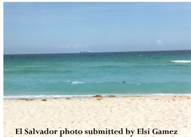
El Salvador photo submitted by Elsi Gamez