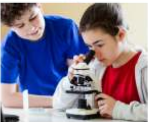
Fun With Science