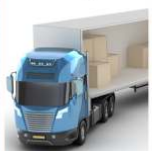
New Careers in Distribution and Transportation