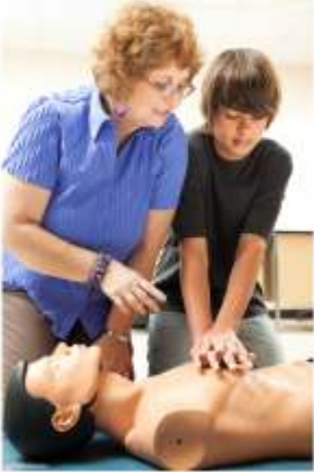
ASHI CPR & First Aid