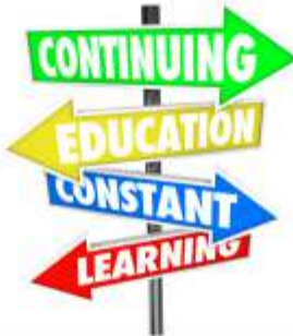
Programs In Every Direction