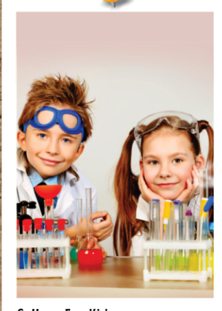
College For Kids