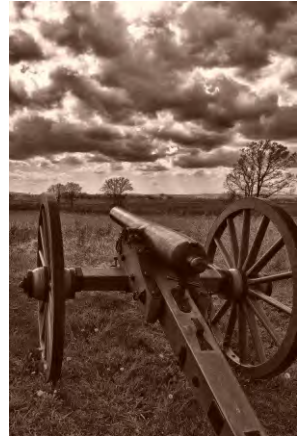
Civil War Seminar