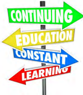
Programs In Every Direction