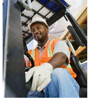
New Careers in Distribution and Transportation