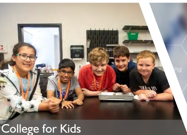
College for Kids