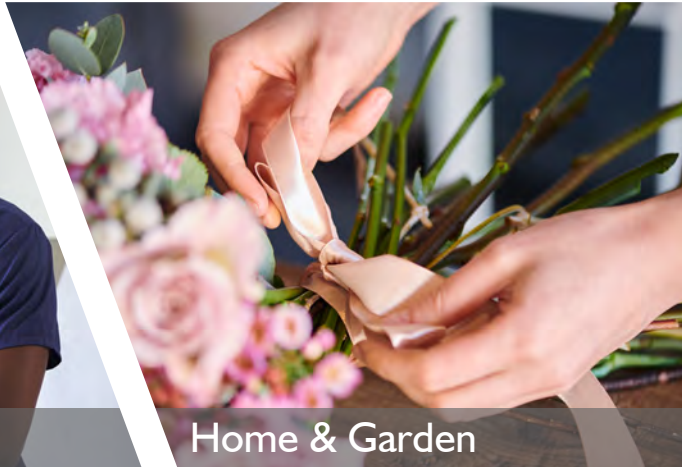
Home & Garden