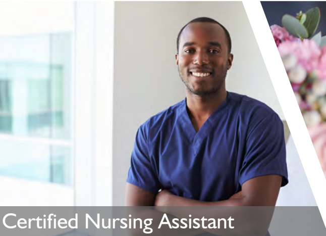
Certified Nursing Assistant