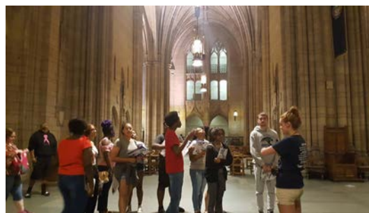
8/1/19: UB students visited University of Pittsburgh for an information session on various academic programs as well as campus tour.

Program Website: www.hagerstowncc.edu/ upwardbound