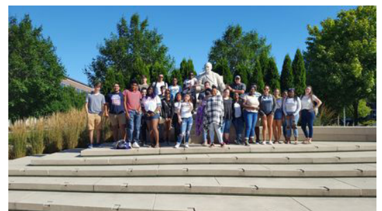
8/2/19: UB students visited Loyola University in Chicago, Illinois for an information session on various academic programs and campus tour.