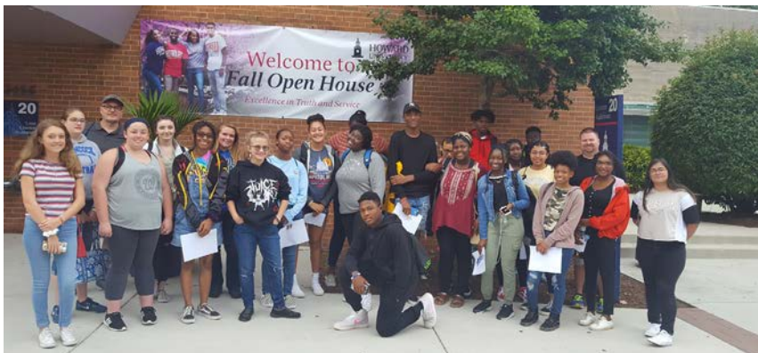
9/28/2019 Upward Bound Students attend Open House at Howard University in Washington DC

Upward Bound is currently interviewing rising freshman for the 2021-22 school year. Students must submit an application and interview with Upward Bound staff to determine eligibility for acceptance. Anyone interested in applying to the program should visit www.hagerstowncc.edu/upwardbound to download an application. Students can also ask their school guidance office for information.