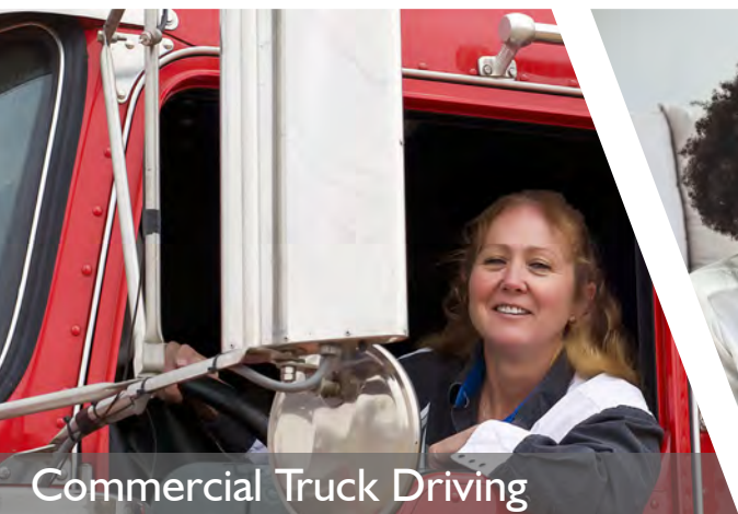
Commercial Truck Driving