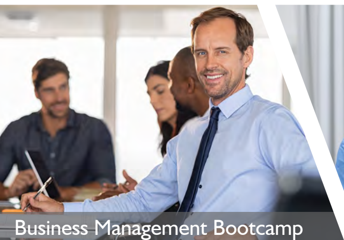
Business Management Bootcamp