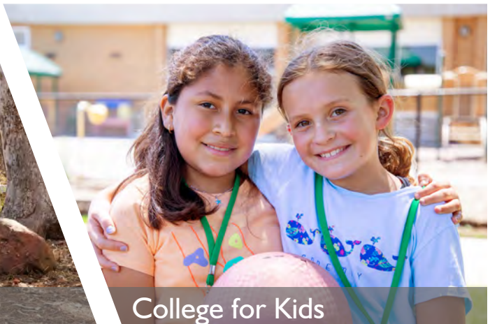
College for Kids

Workforce Solutions • Personal Enrichment • Career Development