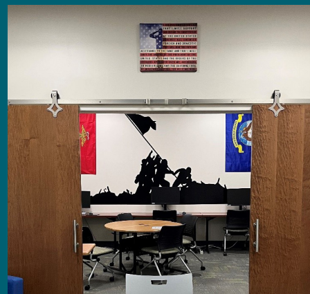
The Veteran's Center in the AC&T Student Center

As we look into the legacies of the past and towards the future of Hagerstown Community College, we can't forget from where we started: an institution of