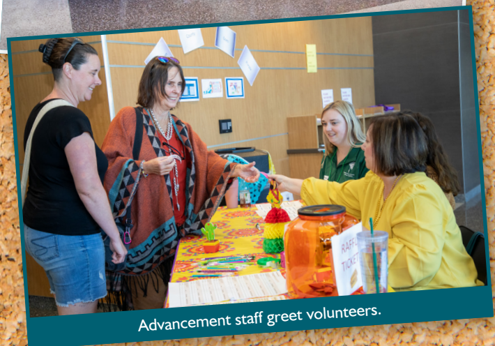
Advancement staff greet volunteers.