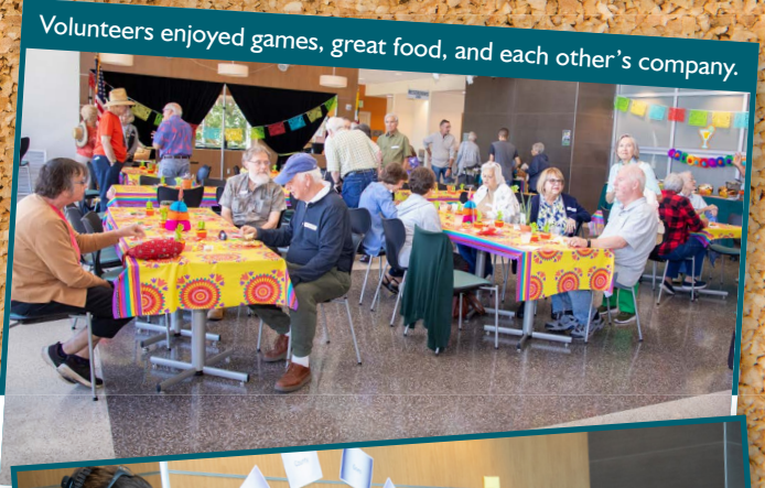
Volunteers enjoyed games, great food, and each other's company.

Volunteers are "tacoing" about the fabulous volunteer fiesta held September 23, 2022, at the college to celebrate all of the volunteers who give their time and service to the college.