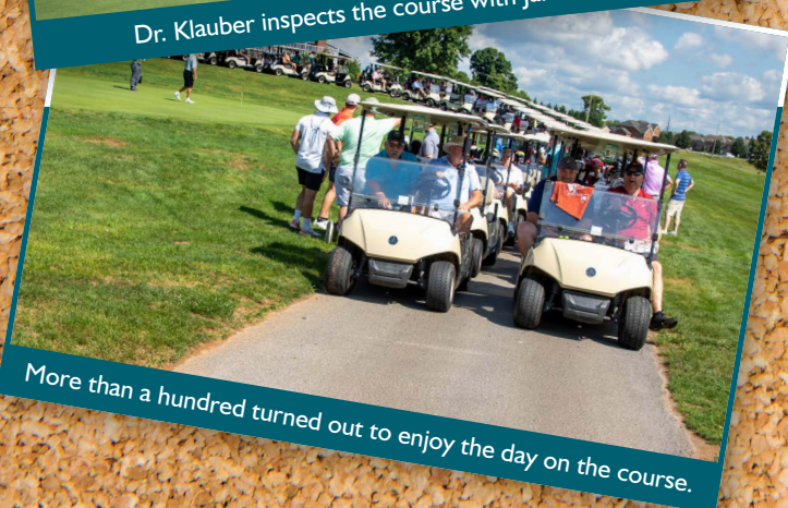
More than a hundred turned out to enjoy the day on the course.