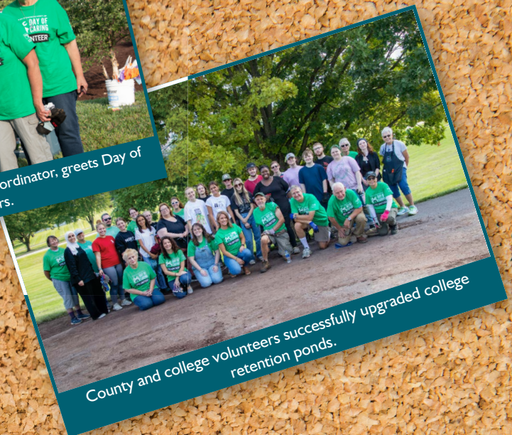
County and college volunteers successfully upgraded college retention ponds.