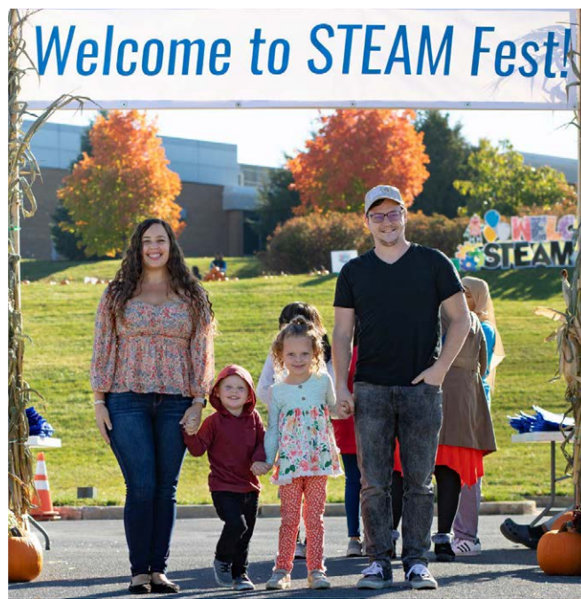
STEAMFest Welcomed Families From Across the Region