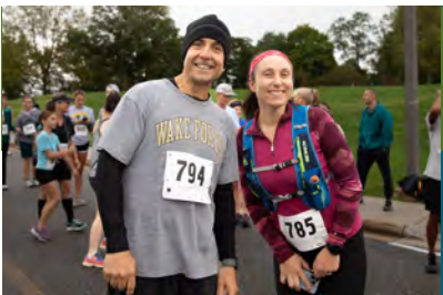
October 7: Hawktoberfest 5k Run/Walk