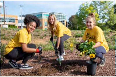
September 21: United Way – Day of Caring