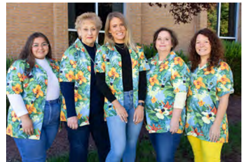
The HCC Hawaiian shirt can be worn in a variety of ways – see how HCC College Advancement staff style their shirts!

Do you want this exclusive HCC Hawaiian shirt? If you donate a minimum of $125 through the Annual Fund campaign by December 31, 2023, you can receive your own HCC Hawaiian shirt! Mail your donation into the HCC Foundation at 11400 Robinwood Drive, Hagerstown, MD 21742 or online at