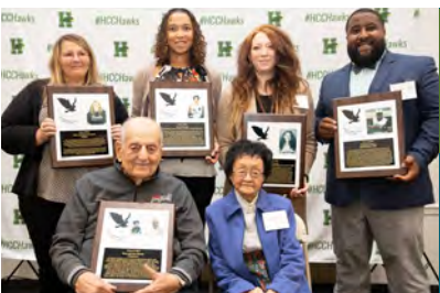
October 7: Athletic Hall of Fame Induction Ceremony