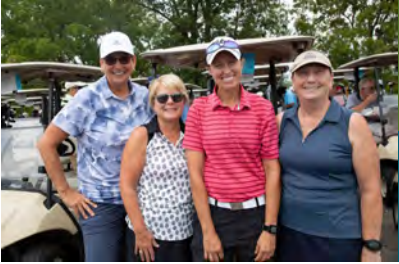
September 8: Alumni Association Golf Tournament