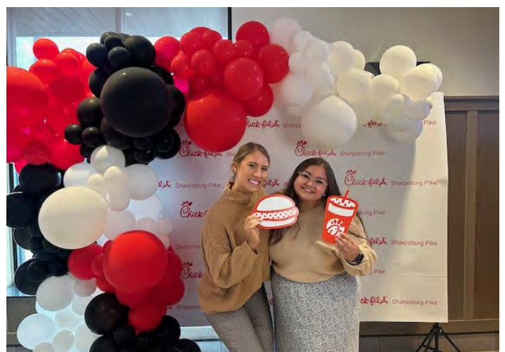
HCC College Advancement Staff visit the new Sharpsburg Pike location with the Greater Hagerstown Committee