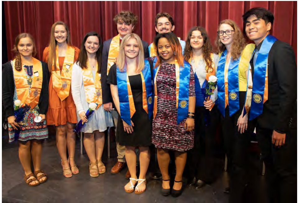
2023 Phi Theta Kappa Students

Phi Theta Kappa (PTK) is an internationally recognized honor society for community college students. Since 1929, it has been the official honor society for two-year colleges, recognized by the American Association of Community Colleges, and has over 1,300 chapters across 11 nations. Founded in 1918, PTK was established to give recognition to community college students with excellent scholarship and character and has maintained fidelity to its founders' commitment to provide enrichment in four hallmarks: Scholarship, Leadership, Service, and Fellowship.