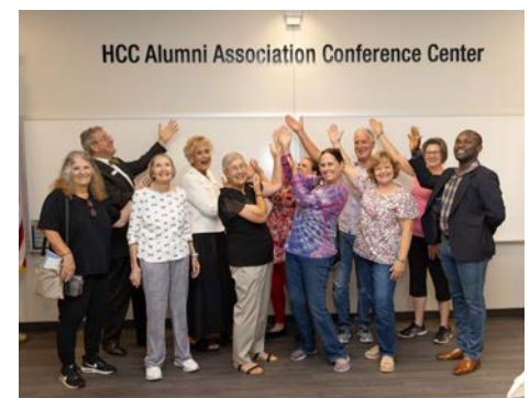
Members of the HCC Alumni Association gather beneath the newly installed Alumni Association Conference Center sign, celebrating the first official naming in the Bowman Training Center.