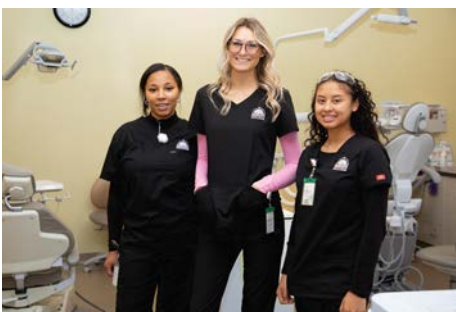
HCC dental hygiene students gain hands-on clinical experience in the college's on-campus dental lab, preparing them to provide essential oral healthcare to the community.

HCC is proud to celebrate a transformational $197,045 award from the Rural Maryland Prosperity Investment Fund, an investment that will open doors for students and expand vital dental care for our community.