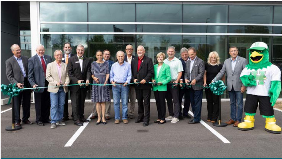
HCC leaders, supporters, and community partners officially opened the D.M. Bowman Family Workforce Training Center with a celebratory ribbon cutting, September 25, 2025.

The D.M. Bowman Family Workforce Training Center was buzzing with excitement on September 25 as Hagerstown Community College welcomed donors, alumni, elected officials, students, and community partners to its official ribbon cutting ceremony.