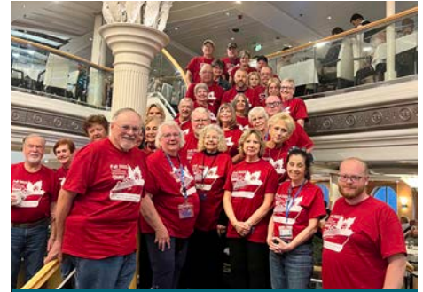
HCC alumni and friends pose for a group photo during the Fall 2025 cruise wearing their matching shirts to commemorate the trip.

The HCC Alumni Association recently returned from its 2025 Fall Alumni & Friends Cruise, a nine-day voyage from Baltimore to New England and Canada aboard Royal Caribbean's Vision of the Seas .