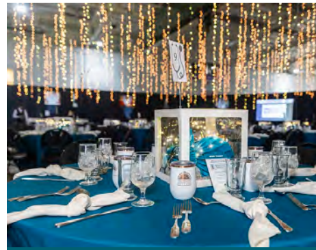
Each year, the ARCC is transformed into an elegant setting to honor the individuals and programs that shape HCC.