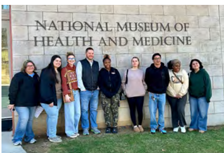
Members of HCC's newest club, HOSA (Future Health Professionals), visited the National Museum of Health and Medicine on a recent field trip.