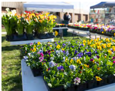
HCC welcomes thousands of visitors to the ARCC each year for the HCC Alumni Flower and Garden Show.

For many, the show is more than an event. It's a tradition.