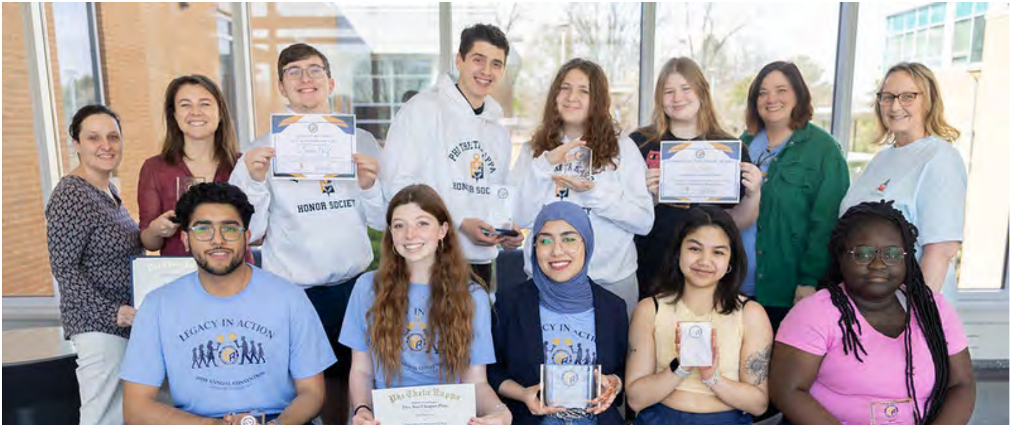
HCC's chapter of Phi Theta Kappa brought home numerous prestigious awards and recognitions at the 2026 PTK Catalyst Conference.

The Phi Theta Kappa Catalyst Conference in Baltimore brought together thousands of students from across the country and around the world to celebrate scholarship, leadership, and service. Students came together to cheer on their peers, network with other chapters, and celebrate their accomplishments. Attendees were also surprised by a keynote address from Wes Moore, Maryland Governor.