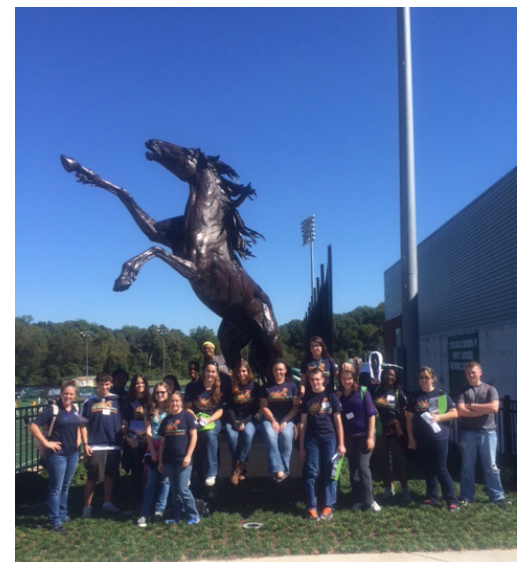
September 27 at Stevenson University Open House; students stand with the university mustang mascot statue overlooking soccer fields.

Students participating in Upward Bound are given several opportunities to visit a variety of colleges within approximately a four-hour radius of Hagerstown which include private and public schools, rural and urban, small, medium, and large campuses. All transportation is provided to students directly from their home, and each student also receives breakfast and lunch while on the trip. The Upward Bound staff assist students in career and college research during monthly Saturday sessions, as well as apply for a variety of scholarships. In order to accurately reflect student interests, surveys are administered and compiled annually to determine plans for future college visits and field trips.