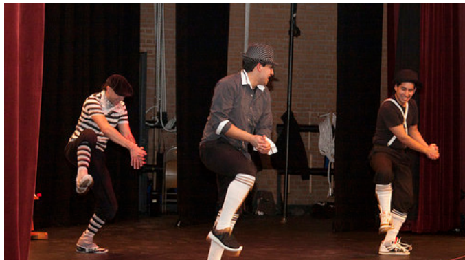
On February 14: Fresh Academics joined Upward Bound in the Kepler Theater for a morning of dance and hip hop. UB students also completed a FAFSA lab, scholarship research and test preparation later that morning.