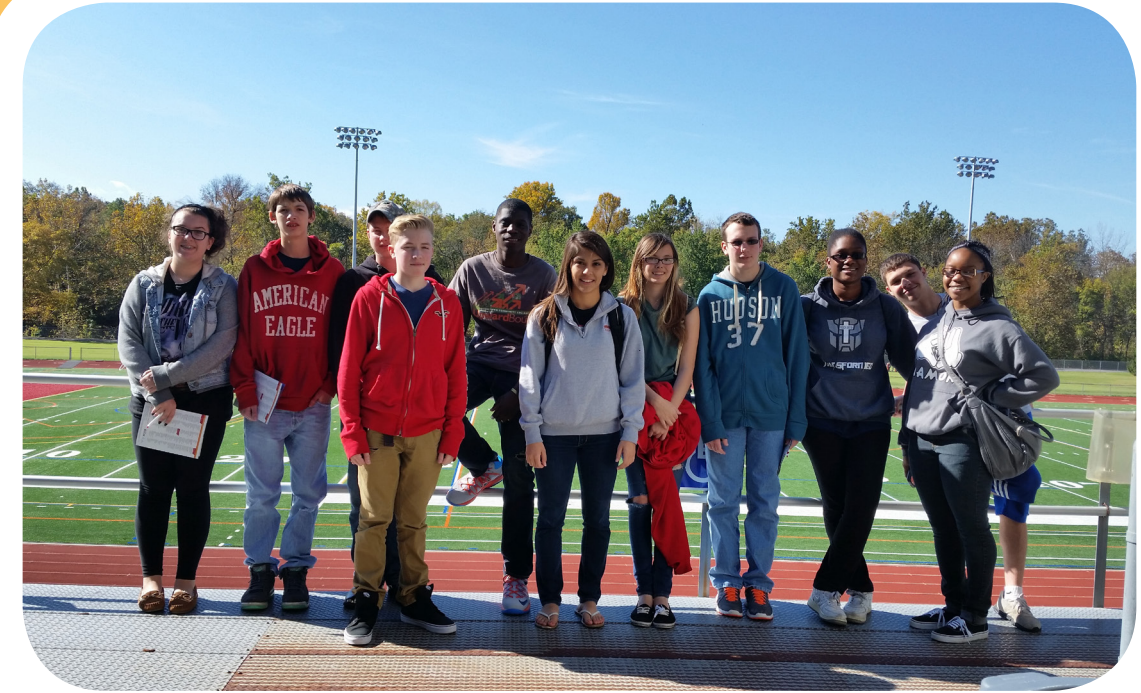
October 17 at Bridgewater College; students were split into smaller groups for campus tours led by college students.