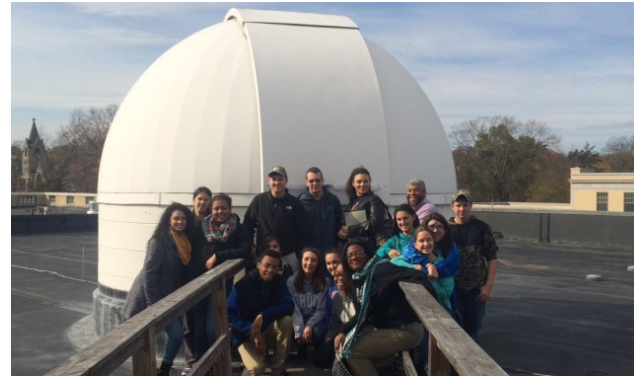
November 3: Students toured the Shepherd observatory located on the roof of the library, which is used to study astronomy.