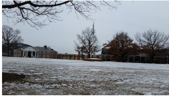
February 16: Students visited the snow-covered Potomac State College. Located in Keyser, WV, Potomac State is a residential junior college and a division of West Virginia University.