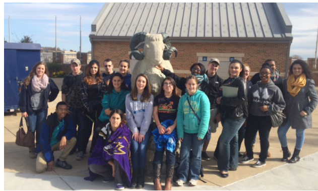
November 3, Shepherd University: Students stand with the university ram mascot.