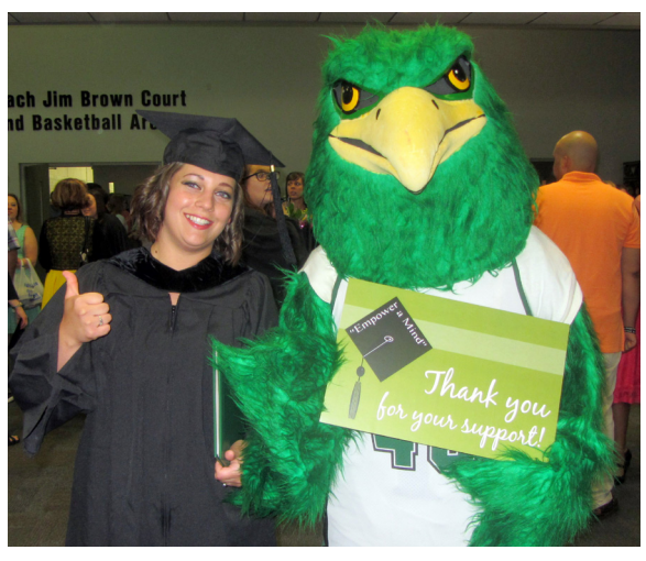
Alumni Celebrate Together