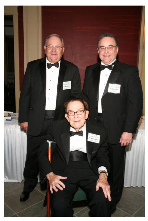
Our Three Presidents

Fountainhead Country Club in Hagerstown. You are invited to attend. The event will feature a social hour, dinner and dancing, a cash bar, and