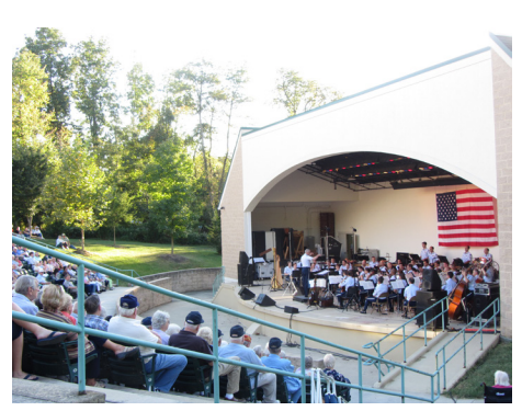
Record crowds enjoy the Alumni Association's "Red, White and Blue Concert Series" at the HCC Alumni Amphitheater

Remember concerts are subject to change by the U.S. Military. Watch HCC's website for more performances as they are added to the program and weather updates on concert nights. Concessions will be sold at all concert