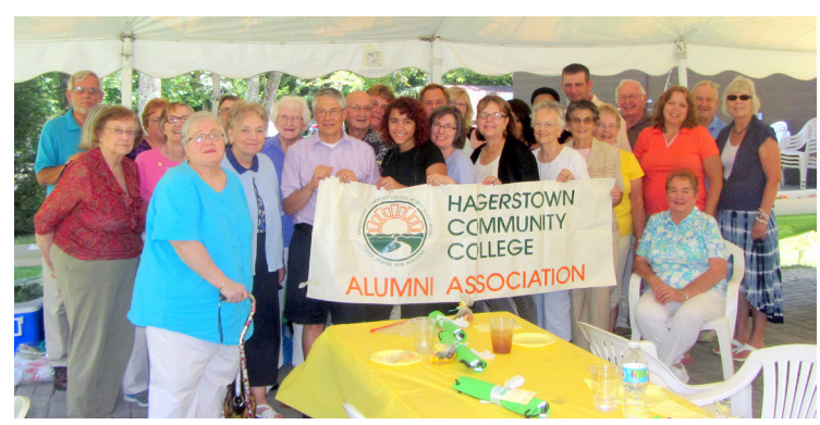
Alumni have Fun Together