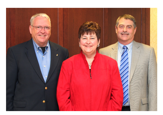
Alumni Advocate for HCC