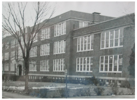
The Old Hagerstown High School Building

To celebrate the many accomplishments of our Alma Mater, we will host a Anniversary Gala on Saturday evening, September 24, 2016, at the