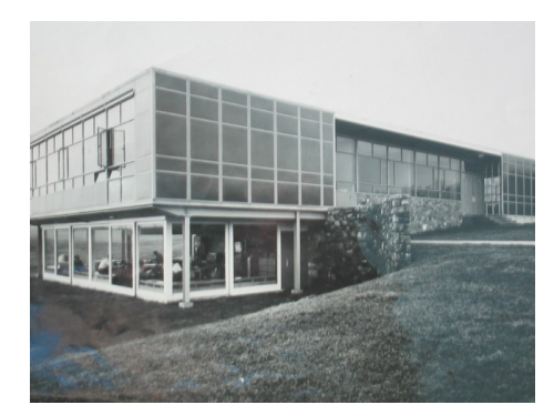
The Cracker Box Building at South Hagerstown High School

The year 2016 marks the 70th Anniversary of Hagerstown Community College/Hagerstown Junior College, Maryland's first community college. Started in 1946, the College was founded to meet the needs of returning veterans from WWII who were seeking job training and education in Western Maryland. Today, 70 years later, HCC is a vibrant, accredited, learner-centered, accessible, lifelong learning institution dedicated to student and community success. The 319-acre picturesque campus encompasses 18 buildings and includes a full-service business incubator, numerous gardens, and an outdoor amphitheater.