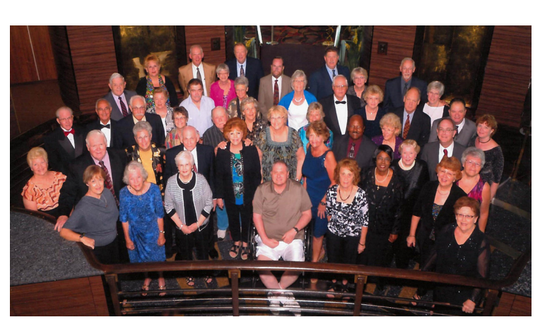
Alumni Travel Together