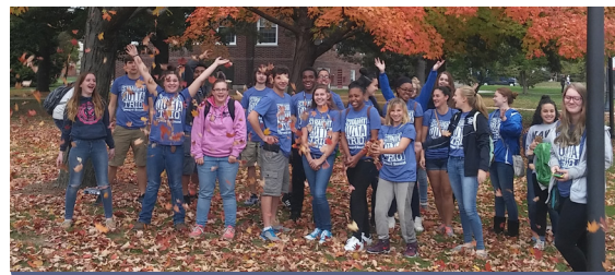
UB Students had a great trip to Gettysburg College this fall. They attended information sessions, got a tour, and played in the leaves!

Check out the dates below to see what events the UB Students have coming up in 2017!