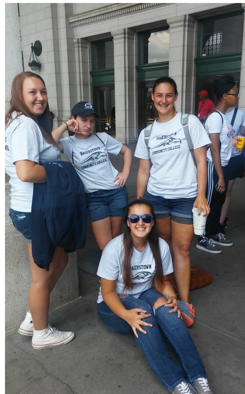
Students waiting at Union Station for the Big Bus tour of DC.