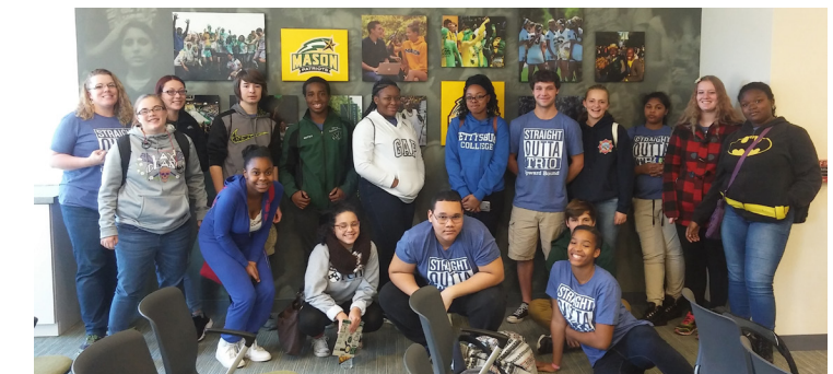
UB students grinning during their tour of George Mason University.