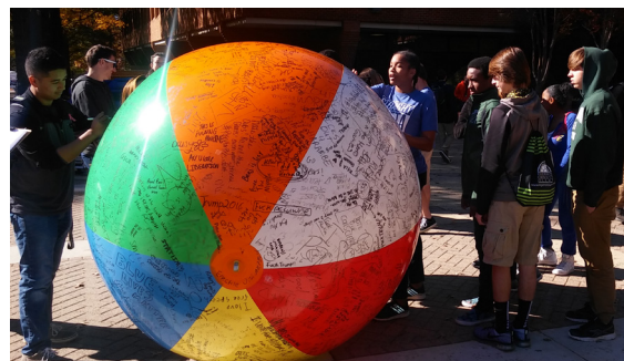
While on a tour of George Mason University, UB Students wrote on a freedom of speech ball. What a cool way to explore our constitutional rights!

Upward Bound is currently accepting applications. Students must submit an application and interview with Upward Bound staff to determine eligibility for acceptance. Anyone interested in applying to the program should visit www.hagerstowncc.edu/upwardbound to download an application. Students can also ask their school guidance office for information.