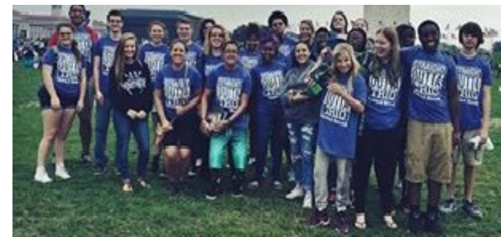
Students gather outside the Washington Monument in Washington, D.C.

South Hagerstown, and Williamsport High School. Students may also transfer to, and attend Washington County Technical High School, and remain in Upward Bound. UB Students receive many services throughout the program that include, but are not limited to: after-school tutoring, Saturday sessions (including financial aid, scholarship information, college and career research, guest speakers, and more), academic guidance and counseling, college visits, a rigorous six-week summer academy at HCC (tuition and fees are paid for via grant funds), student service learning opportunities, transportation services, and meal services during activities. The Upward Bound program continues to broaden the scope of possibility, wonder, and achievement among its students.