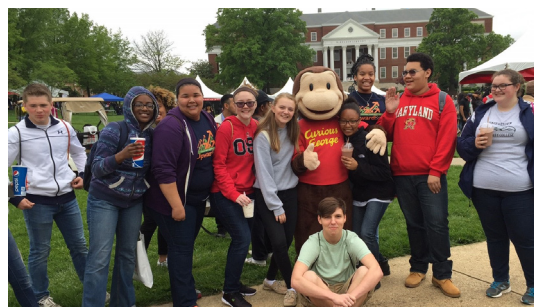
Meeting Curious George at University of Maryland's MD Day was truly a larger than life experience!