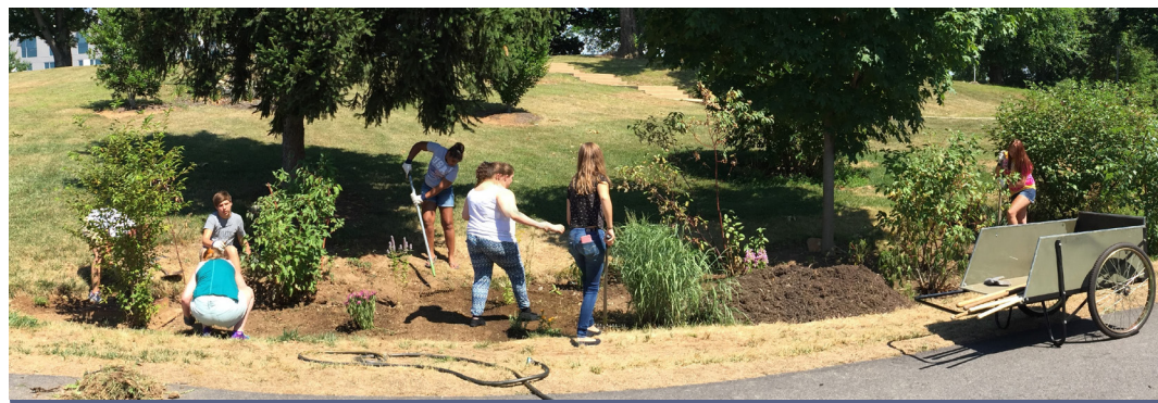
Upward Bound Students working hard to earn Student Service Learning hours with an outdoor beautification project.