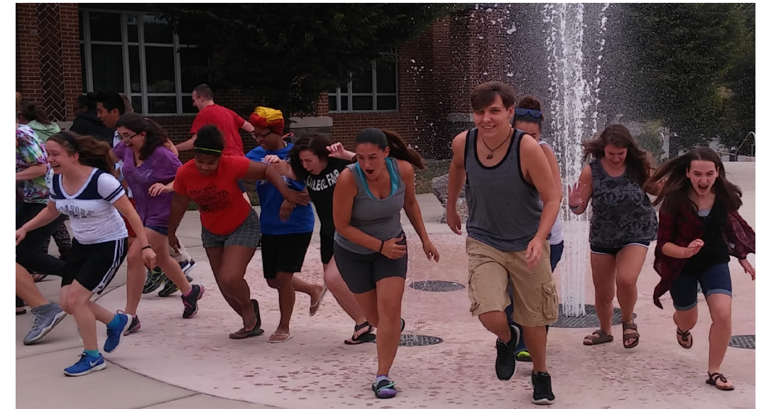
While trying to cool off during the summer program, UB students run from the torrent of water created by the fountain outside HCC's Career Programs Building.

Program Website: www.hagerstowncc.edu/upwardbound