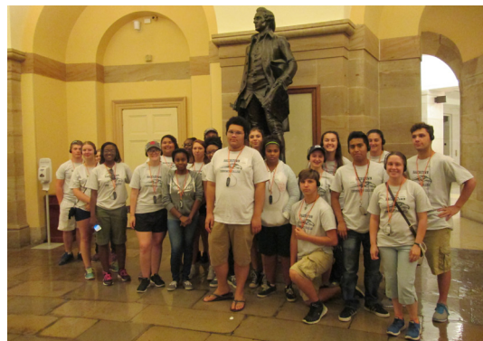
Group picture during a guided tour of the U.S. Capitol Building during the field trip to DC.

Upward Bound hosts an extensive summer academy program here at HCC. The program offers a variety of benefits which include the ability to earn high school elective credit toward high school graduation or college credits during the six-week program. Field trips are incorporated on Fridays for college visits and cultural enrichment activities. During the 2016 summer program trips included Penn State University, George Mason University, Juniata College, Washington College, Delaware State University, and Washington, D.C.