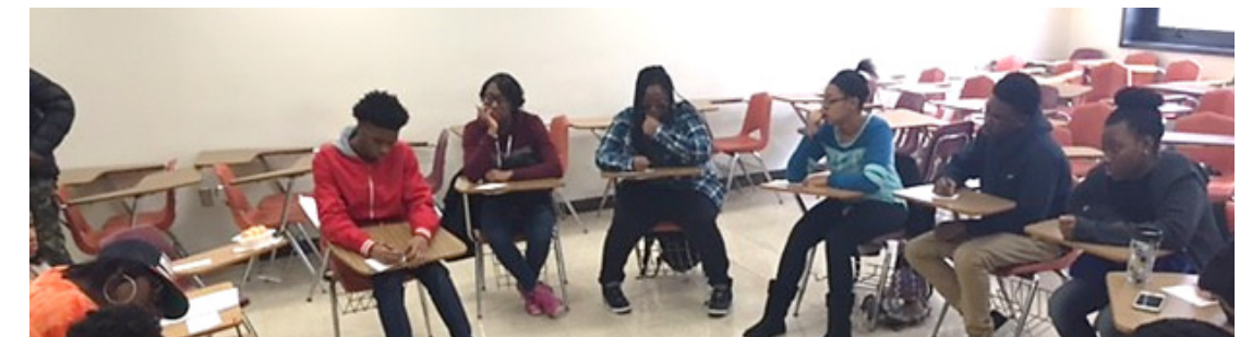
The HCC Upward Bound program partnered with the University of Maryland Baltimore County Upward Bound program for national TRIO Day on February 27th. Students gathered in small groups for a Peer Group Connection discussion, focusing on the meaning and history of TRIO Programs, learning from one another, as well as comparing UB experiences.

Program Website: www.hagerstowncc.edu/upwardbound