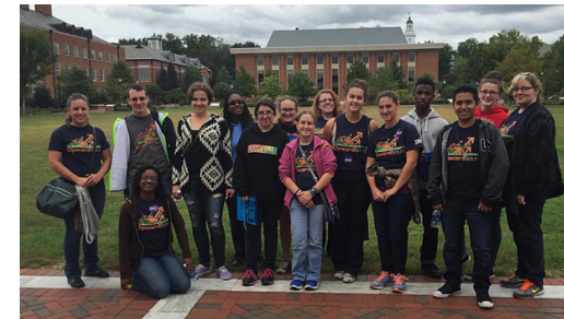
09/26/15: UB students visited Johns Hopkins University Open House for an information session on various academic programs as well as campus tour. Students learned that JHU partners with MICA, offering students various opportunities in film, photography, music, etc.