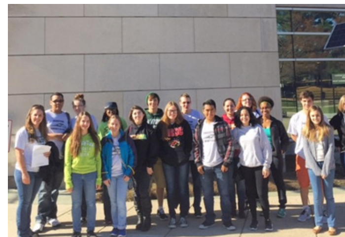
11/3/2016: Students visited National Institutes of Health (NIH) – the largest biomedical research facility in the world and is located in Bethesda, Maryland! With over 20,000 employees, NIH is comprised of 27 different institutes and centers specializing in various research disciplines. Students received a guided tour of various buildings on campus, including the National Library of Medicine.