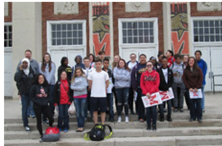
04/30/2016: Students attend Maryland Day – exploring their world of fearless ideas. UB students spoke with staff and college students at several events and exhibits that spanned across the entire campus.