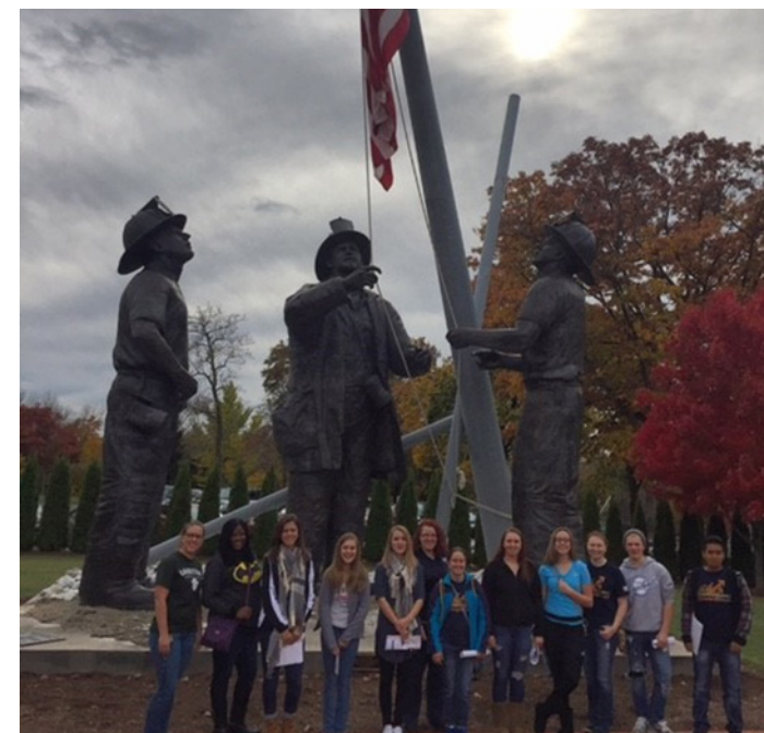
11/2/15: National Emergency Training Center, FEMA; individuals from around the world attend seminars and trainings at NETC throughout the year. Students learned about FEMA Corps - a program that prepares 18 to 24 year olds for careers in emergency management and related fields. FEMA Corps is a devoted unit of 1600 service members dedicated to preparedness, response and recovery.

June 24th Penn State University College Fair & campus tour July 1st George Mason University July 8th Juniata College July 15th Washington College July 22nd Delaware State University July 29th Washington, DC (White House & Capitol building, museums & monuments)