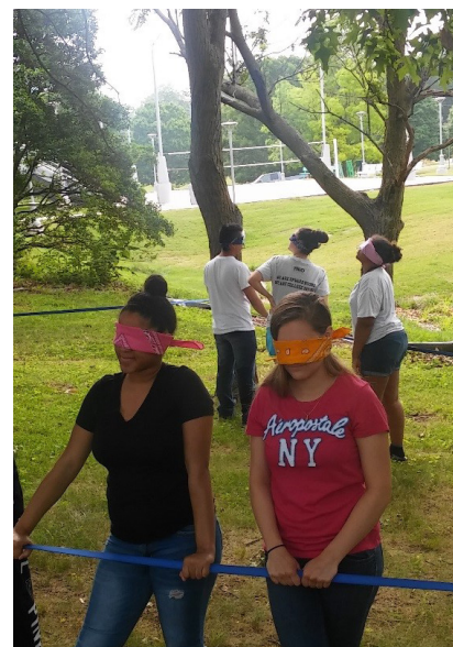
Students participating in a group building initiatives during summer orientation.