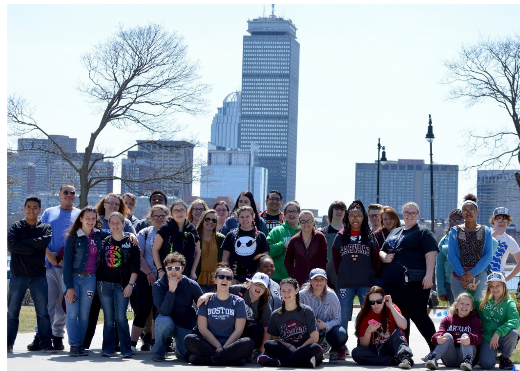
Upward Bound students on the campus of MIT with the Boston skyline in the background.

Each year, Upward Bound hosts an extensive summer academy on the HCC campus. The program offers a variety of benefits including the ability to earn credits for both high school and college graduation. There are also weekly field trips to college campuses that give students the opportunity to gain insight into what types of colleges are of interest to them. During the 2017 summer academy, trips included: University of Virginia, The George Washington University, the U.S. Naval Academy, West Virginia University, and Towson University.