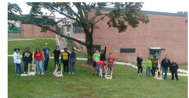
Students built trebuchets to launch pumpkins into the air at the October Saturday Session.