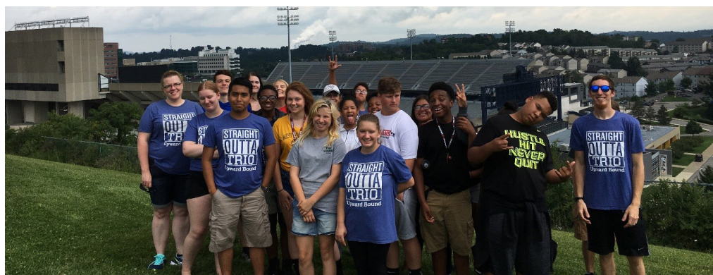
Enjoying the Mountaineer lifestyle at West Virginia University.