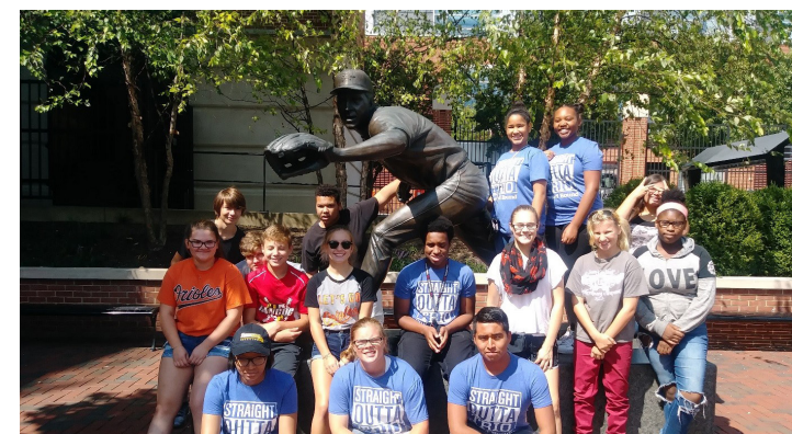
Students got to learn about different jobs in the sports industry during our tour of Camden Yards.

may also transfer and attend Washington County Technical High School, and remain in Upward Bound. UB Students receive many services through the program including, but not limited to: after-school tutoring, Saturday sessions (including financial aid, scholarship information, college and career research, guest speakers, and more), academic guidance and counseling, college visits, a rigorous six-week summer academy at HCC (tuition and fees are paid for via grant funds), student service learning opportunities, transportation services, and meal services during activities. The Upward Bound program continues to broaden the scope of possibility, wonder, and achievement among its students.