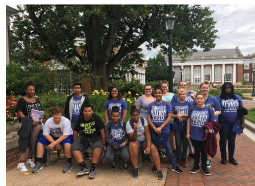
Upward Bound Students Touring the University of Virginia.