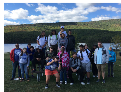
Enjoying the weather and lake at Rocky Gap State Park.

Our annual incentive field trip is a longer, multiple day trip that allows students to see several colleges as well as experience some really cool activities along the way. The incentive field trip is based on a set of eligibility requirements centered on program participation and grades in school. This year, we took 30 students to Boston, MA. Throughout the course of the trip we visited Albright University in Reading, PA, Harvard University in Cambridge, MA, as well as the Massachusetts Institute of Technology (MIT) in Cambridge, MA. Students got to walk the Freedom trail through the city of Boston with notable stops such as the Old North Church (where Paul Revere Hung the lanterns). We also visited Fenway Park, home of the Boston Red Sox. We toured the historic stadium, seeing the iconic Green Monster as well as lesser known parts of the stadium such as their roof-top gardens. All in all it was a successful trip with lots of fun, great food, and long bus rides!