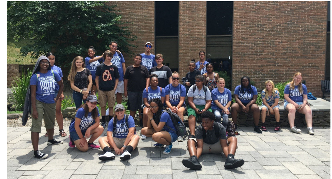
Students visiting Towson University's campus during the UB Summer Academy.

Program Website: www.hagerstowncc.edu/upwardbound