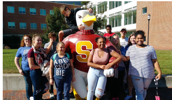
Upward Bound students posing with Sammy the Sea Gull at Salisbury University.

Check out the dates below to see what events the UB Students have coming up in 2018!