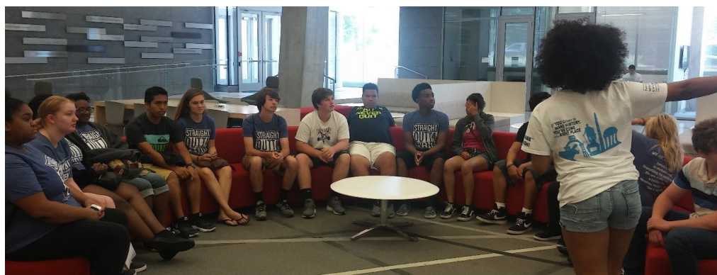
Upward Bound listening to our tour guide describe academics at The George Washington University.